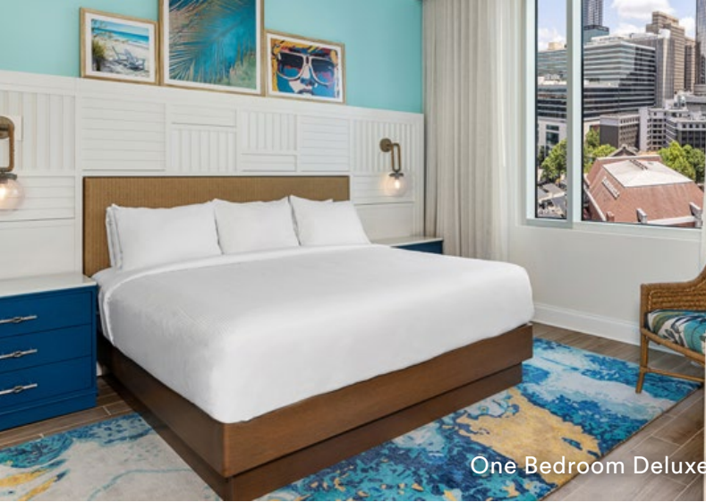
One Bedroom Deluxe