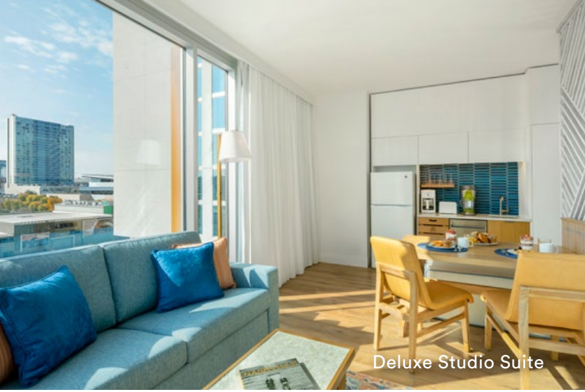
Deluxe Studio Suite