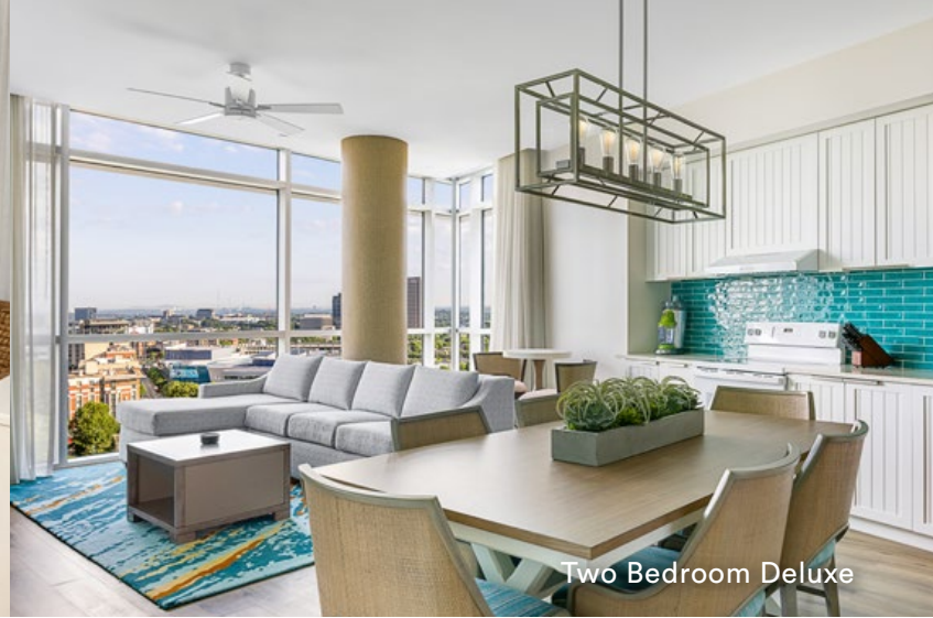
Two Bedroom Deluxe