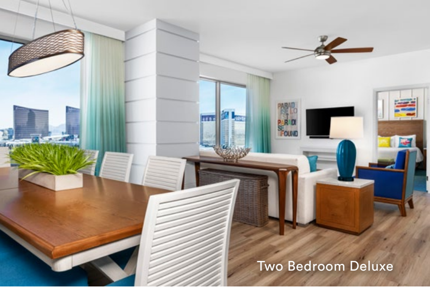
Two Bedroom Deluxe