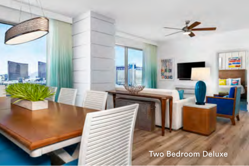
Two Bedroom Deluxe