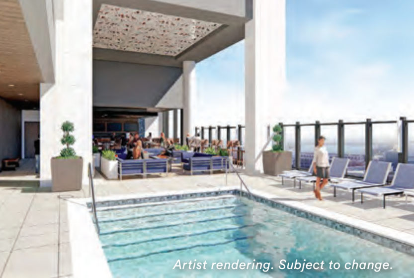
Artist rendering. Subject to change.