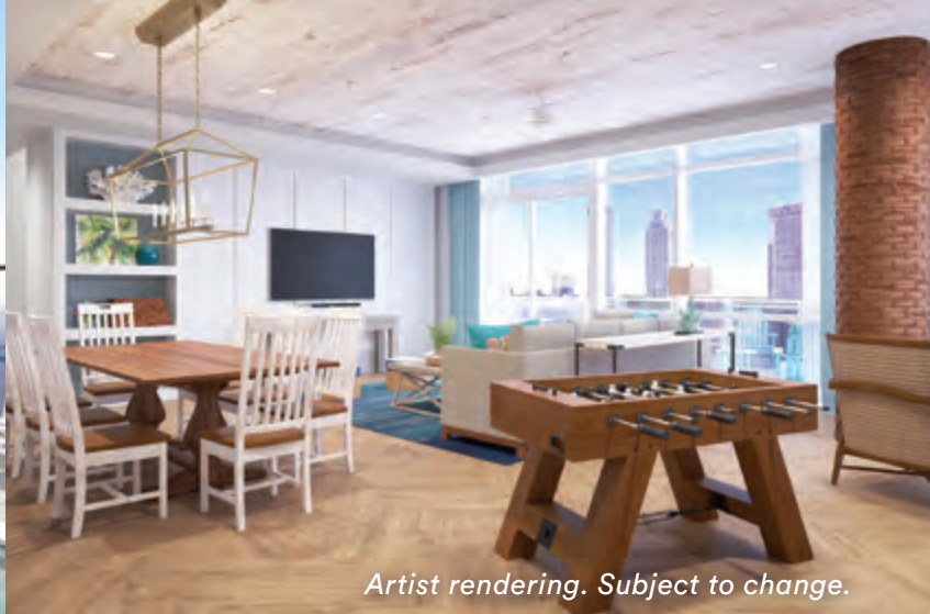
Artist rendering. Subject to change.