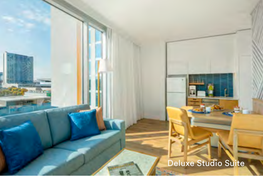
Deluxe Studio Suite